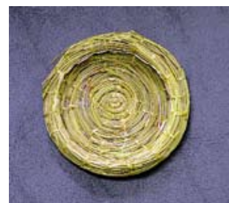
Pine needle basket