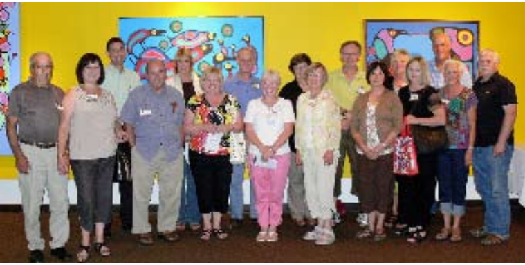
Gardeners and sponsors of the 2010 Garden Tour

On Sunday July 25, the Gallery held its annual Garden tour featuring one public and five private gardens. The event has always been popular, but this year was record setting with almost 900 people viewing the gardens.