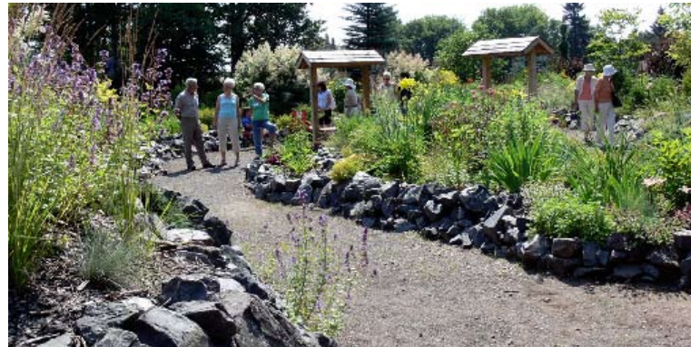
Hope and Memory Garden Viewers