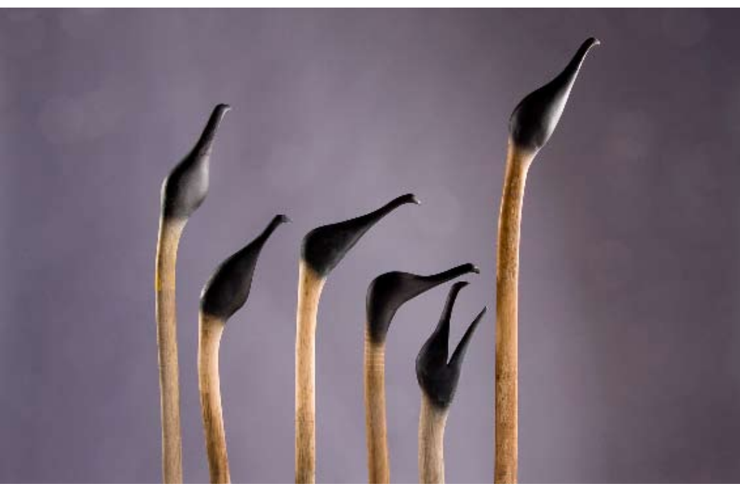
Chris Stones, Rant of the Cormorants , 2009, (detail) epoxy resin on foam, axe handle, concrete and patina.

In Material Memory , multidisciplinary artist Christopher Stones creates a series of sculptural objects that are at once recognizable, yet are obviously transformed from their usual usage and convention. By bringing together distinct functional objects and well-known Canadian icons such as the canoe paddle and the maple leaf to more organic found pieces like driftwood and animal bones, Stones refashions these objects to create sculptural assemblages that challenge any single notion of their original meaning or formal employment.