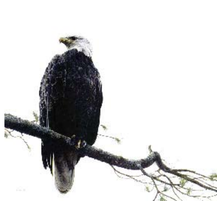
George McLean, Bald Eagle , 1978, casein on composition board, 96.5 x 11.8 cm.; Collection of Leigh Yawkey Woodson Art Museum

Organized and circulated by the Tom Thomson Art Gallery, Owen Sound, ON