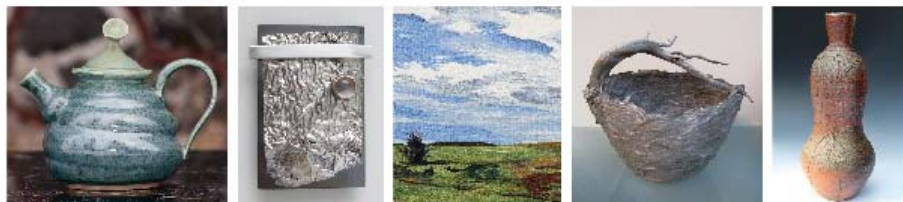
CraftCurrents: Contemporary Craft in Northern Ontario