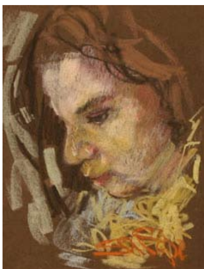
Arthur Shilling, Untitled (Child) , c. 1978, pastel on paper, 76.2 x 58.4 cm.