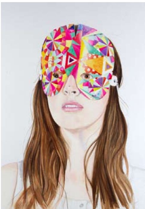
David Shaw, Amy , 2011, watercolour on paper, 55.8 x 76.2 cm.

Shaw's approach intentionally engages with both manual processes, such as cutting, assembling, painting, and digital processes such as research and image sourcing, photography, and digital photograph manipulation. To compose each image, Shaw first posted an online invitation for participants to take part in his series as sitters for a single painting. His invitation received many responses from friends and strangers and who were invited to select from a collection of masks they felt best suited their overall personality and self-image. Each sitter then had their photograph taken, which Shaw later manipulated digitally, printed, and used to paint