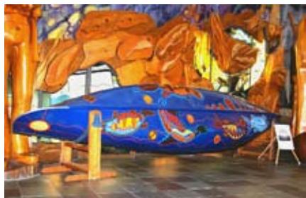
Canoe on display at Fort William Historical Park